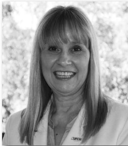
By Diane L. Sedor

An estimated 139,860 people in the United States will be diagnosed with leukemia, lymphoma or myeloma in 2010. New cases of these cancers of the bloodstream will account for approximately 9.5 percent of the 1.5 million cancer cases that will be