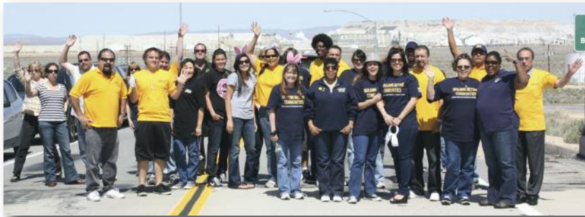
UFCW Local 1428 members in front of the Rio Tinto borax mine.